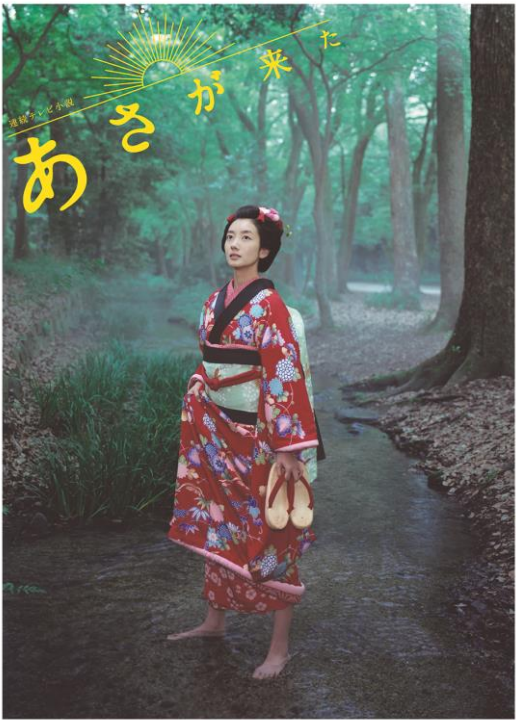
This Program is provided in cooperation with the Japan Foundation.

This drama is set in late 19 th -century Japan, at a time when women were rarely in the limelight, there lived a colourful female entrepreneur, Asa, in the merchant city of Osaka. Asa worked hard not just to make money, but also to realize a world where everyone is happier than now. Our young heroine Asa has married into a notable business family in the city. However, due to the changing times, the family business encounters difficulty, and her unmotivated husband leaves the entire business to Asa. This heartfelt and humorous hit drama, portraying the amazing business woman Asa, is inspired by a real Japanese female entrepreneur.