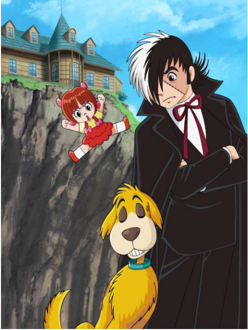
(c) Tezuka Productions This Program is provided in cooperation with the Japan Foundation.

Black Jack is an animated series in which an illegal doctor with outstanding surgical abilities, saves patients in serious conditions in exchange for tremendous service fees. Is he just evil or the man who has the hands of God? The medical human drama series, revolving around Black Jack and people around him, draws in the audience with its compelling storylines.